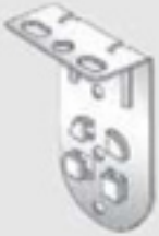
Idle End Bracket