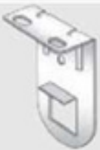
Chain End Bracket