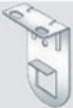
Chain End Bracket