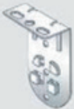
Idle End Bracket